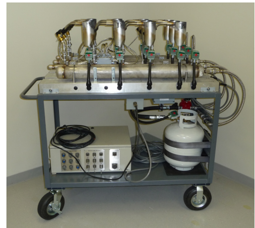
HFITS INFRARED SOURCE